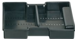
KIT TRAY MUB